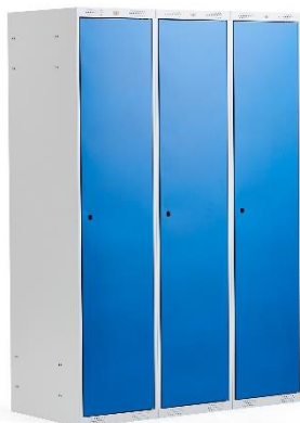
Clothes locker, flat roof

This EPD applies to AJ Products clothes locker Classic, 3-section. High-quality clothes lockers with a welded steel frame, power coated with blue, grey or black doors. The 3-sections are available with sloping or flat roof also as a combo locker with two doors for one person with sloping roof. These lockers are highly adaptable to pair with other sizes and combinations to fit your needs and preferences. The steel-plate lockers are perfect for storing clothes and personal belongings in workplaces, gyms, schools, exhibition rooms and other public areas.