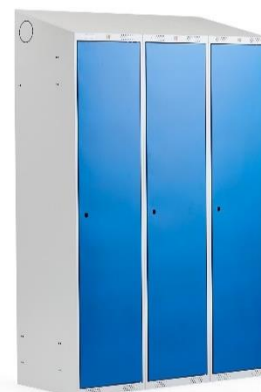
Clothes locker, sloping roof