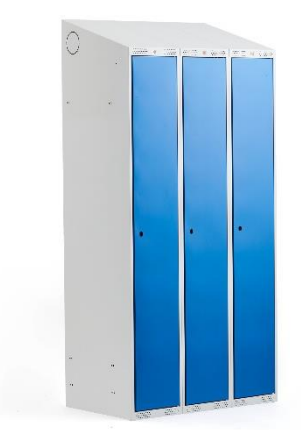
Clothes locker, sloping roof