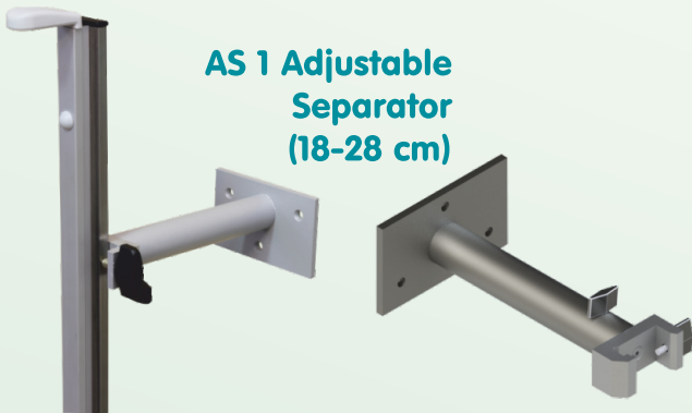
AS 1 Adjustable Separator (18-28 cm)