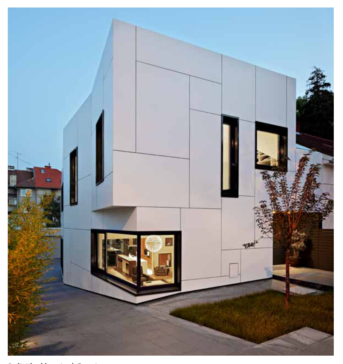
Individual housing | Croatia

Architects are generally not involved when building or refurbishing small buildings or their façades. In over three quarter of all cases, the building owner and the contractor jointly agree the final appearance and design for the building. This brochure helps you select the right façade material.