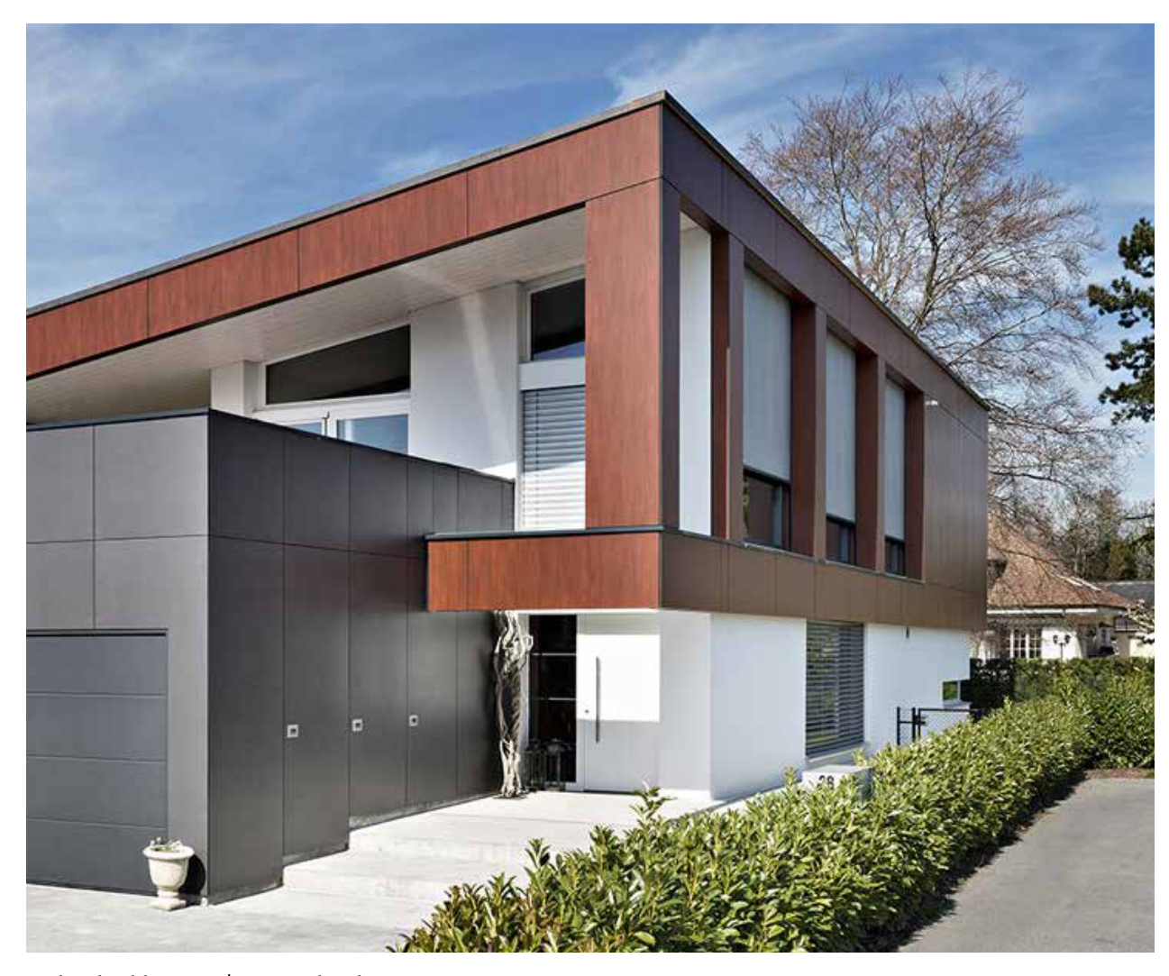
Individual housing | Switzerland