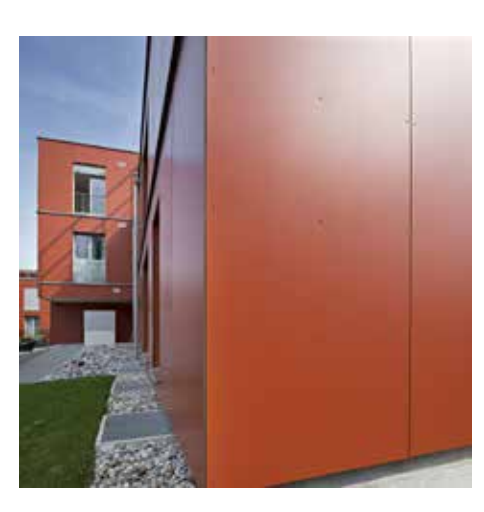
Multi housing/Apartments | Switzerland