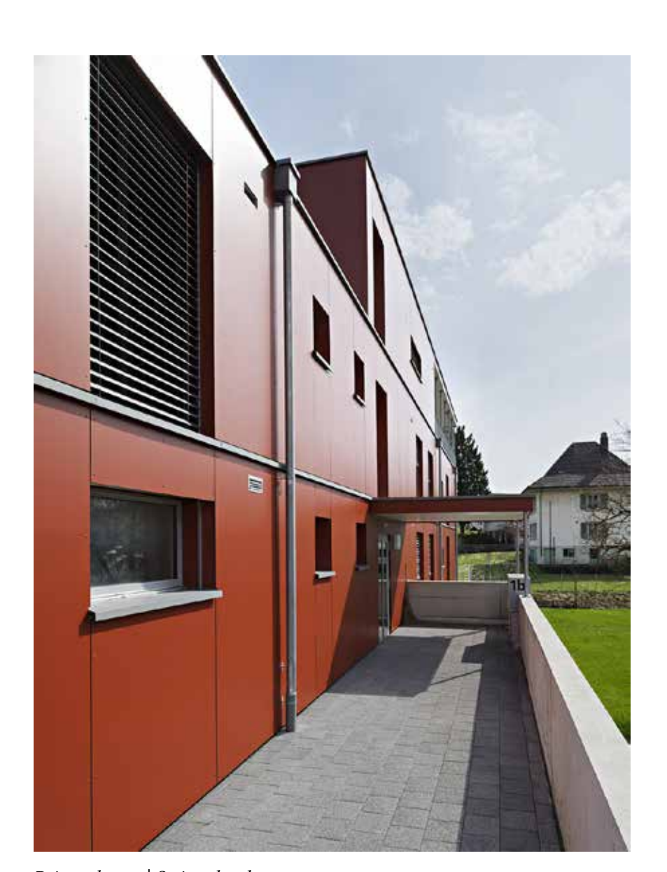
Private house | Switzerland

The closed surface of Trespa® Meteon® practically withstands dirt accumulation, keeping the product smooth and easy to clean. Contaminants like soot, crayons, graffiti and even permanent markers are easy to remove if the appropriate cleaning methods and products are used in accordance with Trespa's cleaning and maintenance instructions (trespa.info).