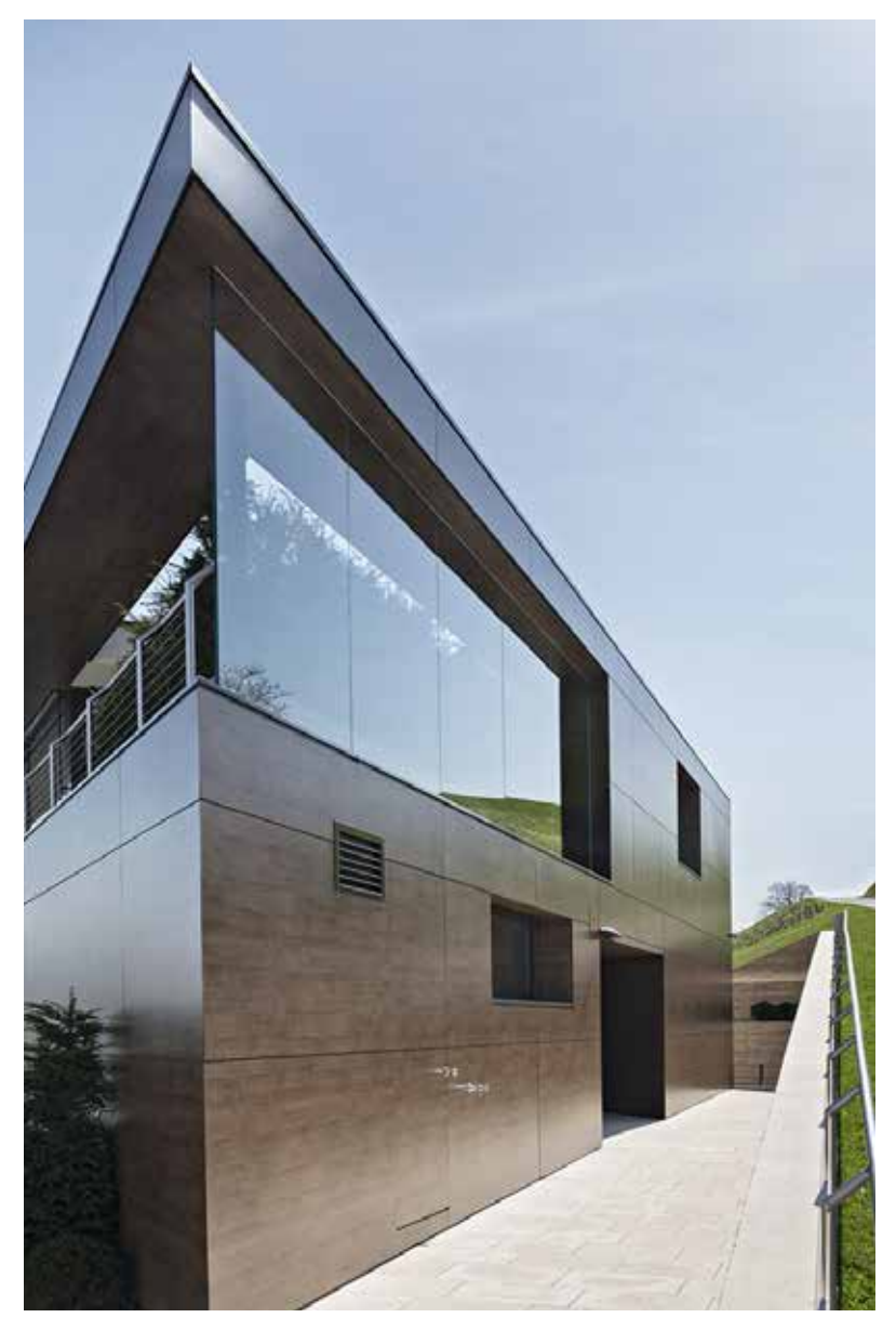
Individual housing | Switzerland

The edges of Trespa® Meteon® do not require extra finishing; even sharp corners can be achieved without finishing. The risk of chipping on the edges is very slight; furthermore, various fixing methods are available to install Trespa® Meteon® panels.